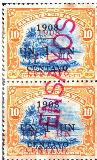
Similar Bogus 1908 'ENSAYOS' and Red Surcharge