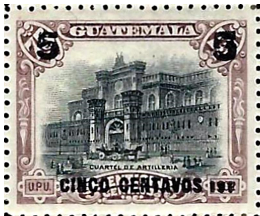
'191' Variety Scott 149a

All red 1c and 5c surcharges are bogus, including all 'ENSAYOS' overprints. The 5c surcharge with the '191' error was extensively faked but none have the flat topped 'C'.