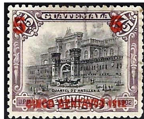
Bogus BFH 5c on 75c Red Surcharge