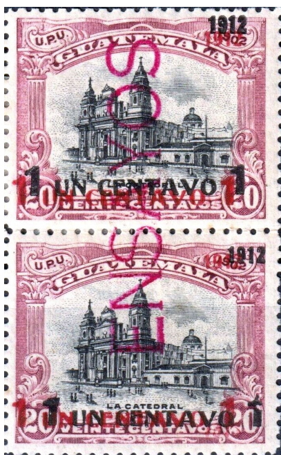
Bogus BFF 'ENSAYOS' and Red Surcharge