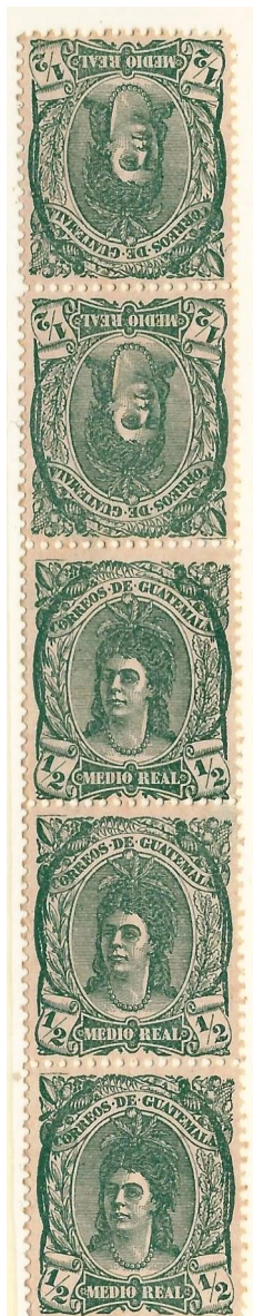
Reprint with tête-bêche pair