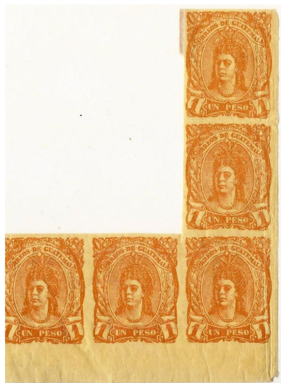
Imperforate Second Forgery