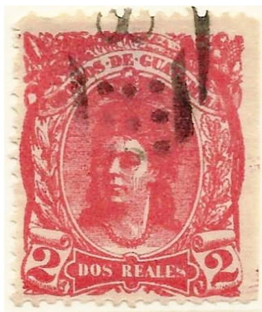
Fake Large Numeral 8 Cancel On Reprint