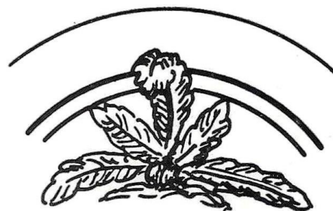
Feathers in First Forgery