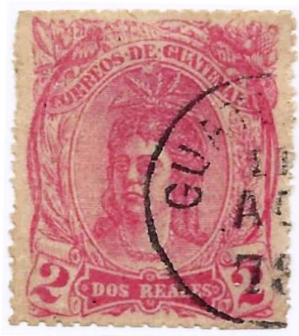
Typical Fake Cancels on First Forgery