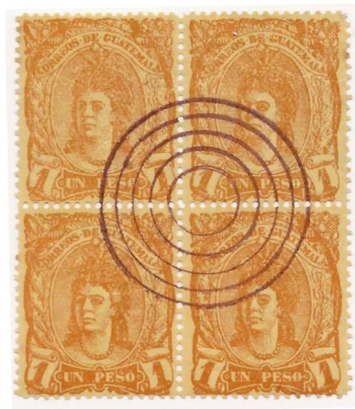
Fake cancel on Second Forgery (Possibly Raoul de Thuin)