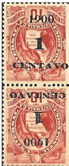
ISGC 109c—Tête bêche pair