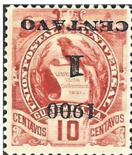
Scott 98a - Inverted Surcharge